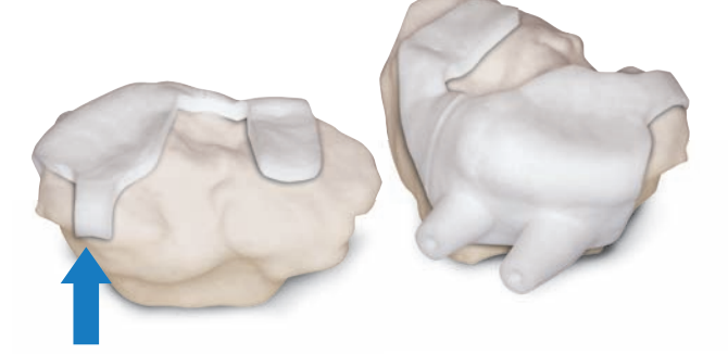
Tibial Pin Guide Posterior hook on the medial side of the tibia guide stabilizes guide and eliminates lateral rotation.