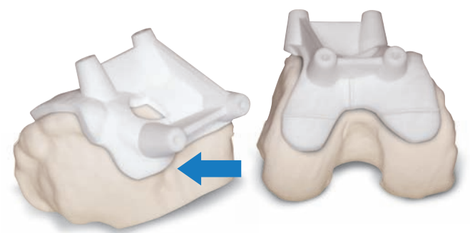
Femoral Pin Guide Anterior ridge stabilizing mechanism on the femur guide ensures a secure fit.

The custom pin guides are designed with position stabilizing features and anatomical reference lines including the transepicondylar, mechanical and AP axis to verify positioning and eliminate variability of placement.